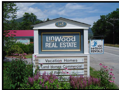
A sign that is low to the ground, easily visible, and attractive.

c. Consider adopting a sign ordinance that is aesthetically pleasing and provides for adequate business promotion; give special consideration to the U.S. Highway 211 corridor.