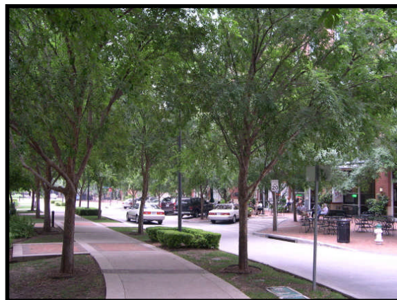
An example of a neighborhood with street landscaping, pedestrian and car access, and a mixture of uses.

b. Consider requiring the inclusion of some percentage of open space in all residential areas.